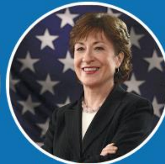
Rep. Collins (R-ME)