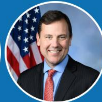
Rep. Kean (R-NJ)