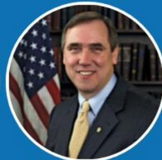
Rep. Merkley (D-OR)