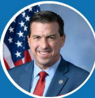
Rep. Mullin (D-CA)