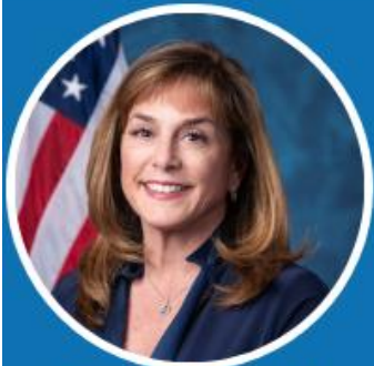
Rep. McClain (R-MI)