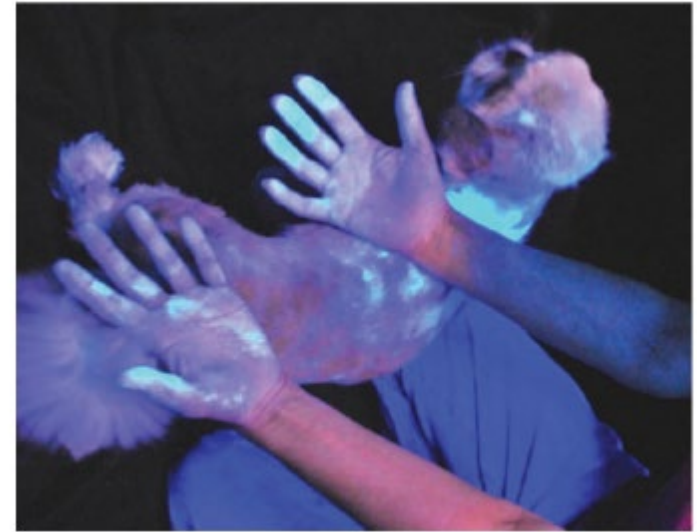
Fig. 3. Handling of a dog treated with Frontline ® containing 1% Tinopal ® CBS-X fluorescent tracer revealed contamination of hands during routine application and handling of a treated dog (color figure available online).