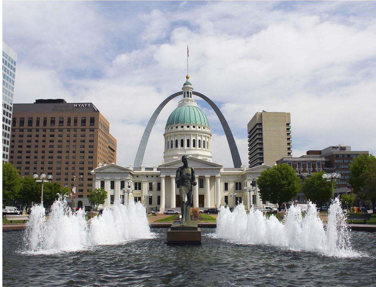
Runner Fountain and Old Courthouse and Arch