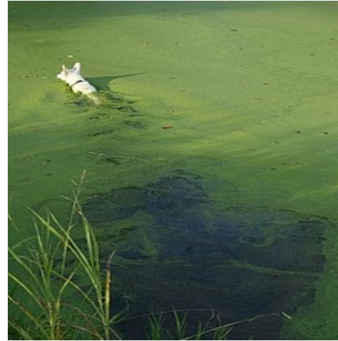
Surface water quality