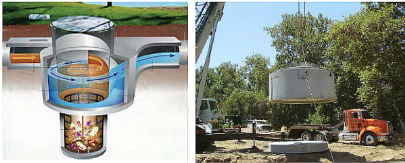
Clockwise from top-left: A gross solids removal device, Large trash nets collecting trash and vegetation after a storm, installation of a hydrodynamic separator in San Jose, California, A diagram of a hydrodynamic Separator.