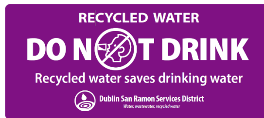
Large container stickers 4" X 8"