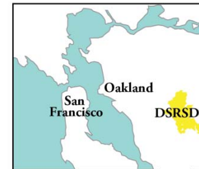
Regional View/Service Area Map