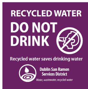
Small container stickers 3.5" X 5"